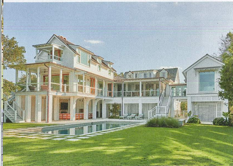
The side bedroom wing (above) was originally a separate cottage and is now attached via a glass "hyphen." The rear addition includes an open great room on the main floor, and a master suite on the second floor. Top: The stairway was updated with new newel posts and square pickets.

into a small bedroom. "We kept it raw," Clowney says, referring to the original interior walls, some of which retain the colorful patina of weathered layers of paint added over the years.