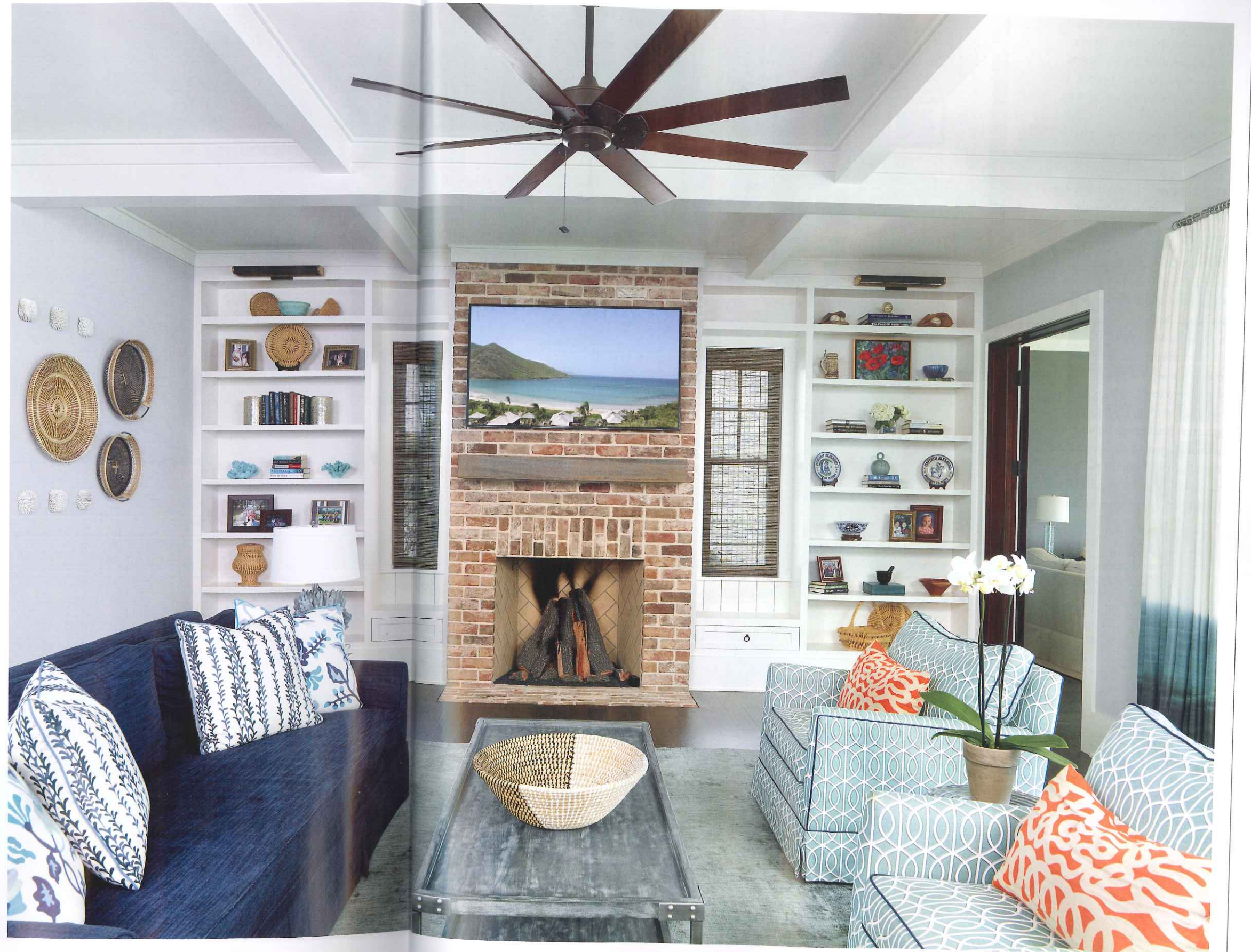
Above: White shiplap walls and dramatic lighting fixtures inspired a family photo gallery in the upstairs hallway. Right: Regina Garcia Design selected highly functional furniture and accessories for the home's family room, which features a navy-colored sofa and print chairs in keeping with the homeowners' desire for traditional styling with a nod to transitional.