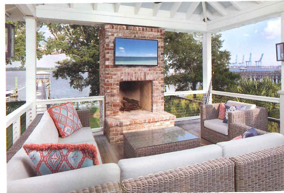
Opposite: The view from the front entryway captures the visitor's eye and draws it over a handcrafted dining room table, built by Landrum Tables, all the way to the Wando. The rug under the table and the drapes in the family room mimic the flow of the river. Above: Designed for busy mornings, the breakfast room features built-in bench seating, which provides plenty of storage space. Below: An extension of the main living space, this outdoor porch with a brick fireplace is a favorite spot for the family to gather to grill, watch television and play games.